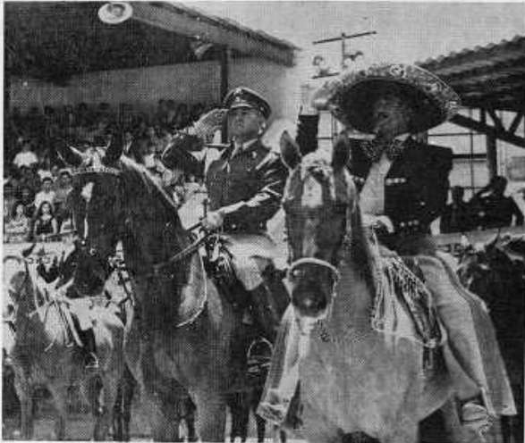
Photo from the 16th Anniversary program from St. John's Playground International Horse Show, 1974.