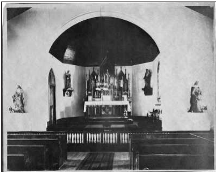
Interior of St. Genevieve's, 1905. The cornerstone for the fourth, and present, church was laid in 1904. This was one of the first pictures taken after completion of the new building.