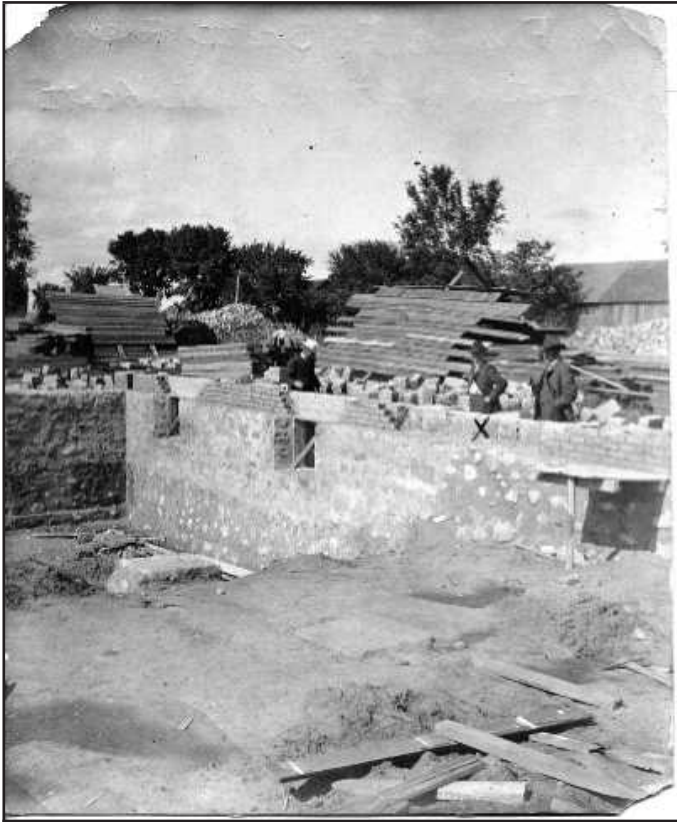
Building the basement of St. Genevieve's third church building, 1870.