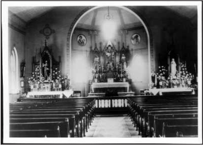
The interior of St. John the Baptist, 1947. Note the ornate carved altar and communion rail.

The early pastors of St. John's were French speaking and that was a consideration for their appointment. The great majority of the congregation was French Canadian and more at home with the French language than English. At least one Mass, and preaching was done in both French and English until 1941.